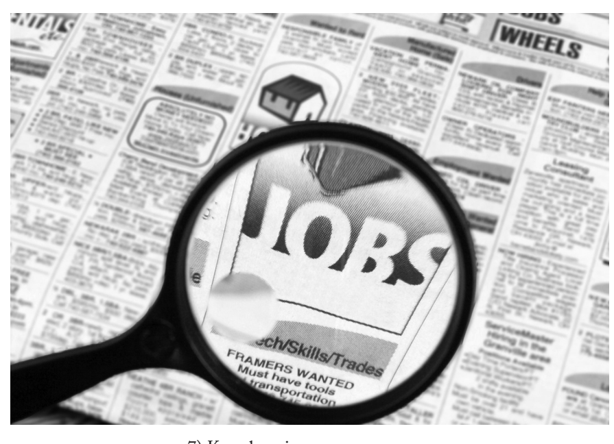
7) Keep learning.

Most people conduct their job search alone. Instead, find out whom else is looking for a job and share contacts and ideas. Perhaps your friends can keep you from getting discouraged or keep you accountable.